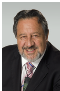
Hon Dr Pita R Sharples Minister of Māori Affairs

Before progressing further with these propositions, it is important that the Panel tests its thinking by obtaining feedback from landowners themselves, and those with an interest in Māori land and Māori land development. We hope you take the opportunity to read this discussion document and provide the Panel with your views.