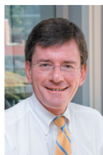
Hon Christopher Finlayson Associate Minister of Māori Affairs